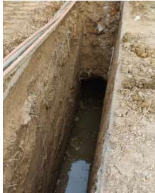
Soil improvement works

2. 1st and 2nd quantity surveying of works (25/6/2020 and 20/7/2020 respectively) concerning the relocation of a section of approximately 450m of drainage networks with their respective wells and related earthworks on Thessaloniki Street. They were both approved by the Contracting Authority on 5/8/2020.