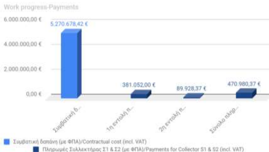
Graph 2. Payments until 31/08/2020 (information regarding the 1st payment is detailed in the 2nd Report of the IM , p. 5)

3. 2nd Payment Order on 5/8/2020 for the amount of € 89,928.37 regarding the above 1 st and 2 nd quantity surveying , which was approved by the Contracting Authority (Attica Region) on 6/8/2020.